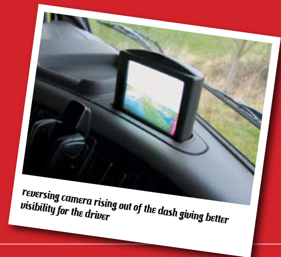
reversing camera rising out of the dash giving better visibility for the driver

“ We have a number of approvals and accreditations with national and multi-national organisations ”