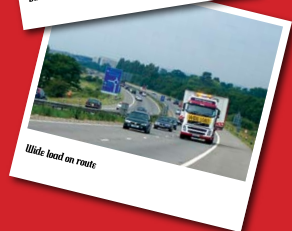
Wide load on route

“ Highly trained and experienced drivers give our customers peace of mind when required to carry the most demanding loads ”