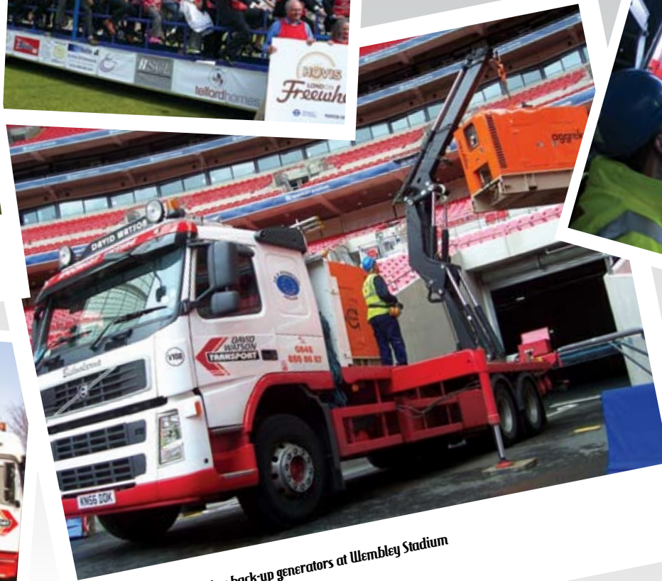
Delivering and positioning back-up generators at Wembley Stadium