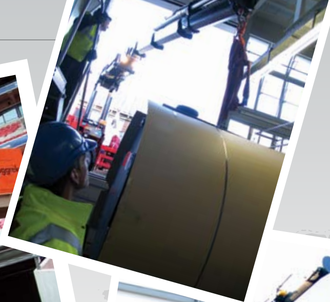
Installing a brand new boiler weighing 8.5 tonne into position at a factory in Chelmsford

“ Over the years we have moved countless awkward and unusual loads ranging from Hawker Hurricanes and expensive cars to statues and record breaking bikes ”