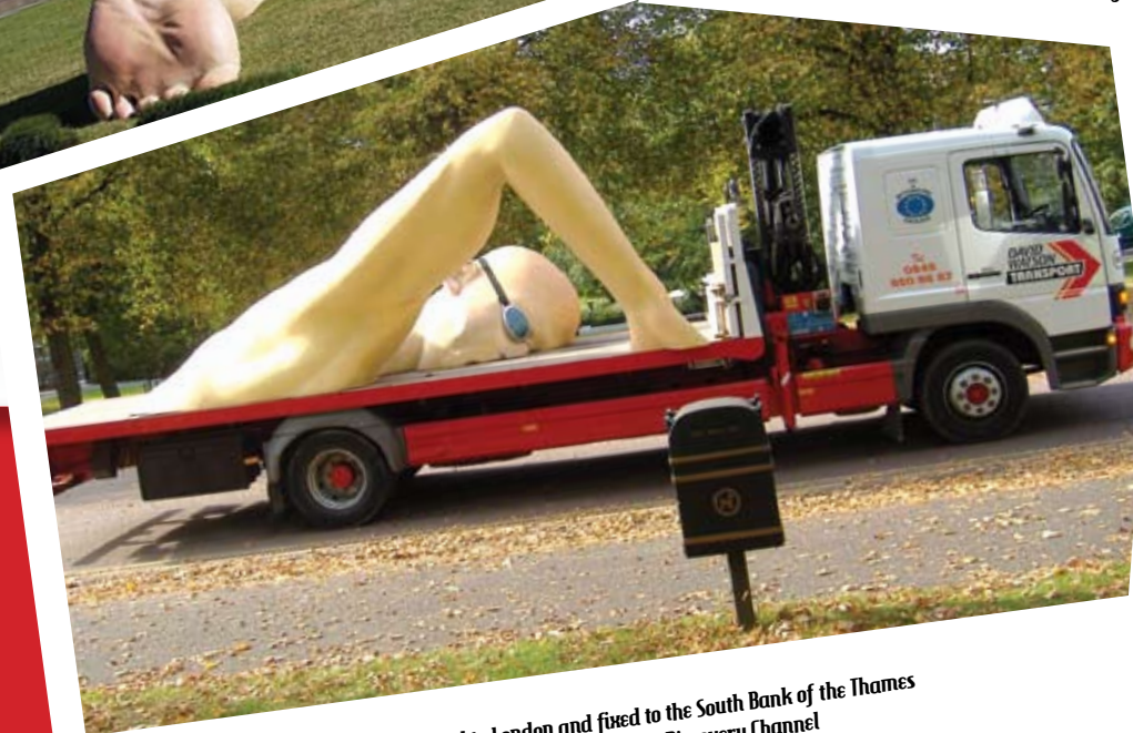
The gigantic swimmer statue was delivered to London and fixed to the South Bank of the Thames as an advertisement for a new TV show called "London Ink" on the Discovery Channel