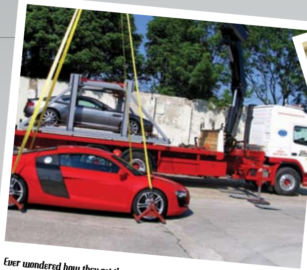
Ever wondered how they get those expensive cars you can win in a raffle into the departures lounge at airports? They use us! Delivering the brand new R8 and Aston Martin and removing the BMW M3