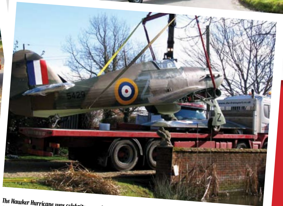
The Hawker Hurricane was celebrity owned, which we transported after refurbishment to a local airfield for its first test flight