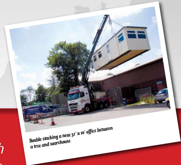
Double stacking a new 32' x 10' office between a tree and warehouse

“ The vehicles specified for cabins can have a reach up to 16 metres, which allows us to position cabins end on, over obstacles and also double stack ”