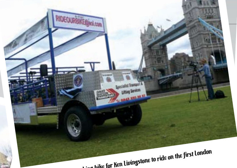
Delivering the record breaking bike for Ken Livingstone to ride on the first London Freewheel event in 2007