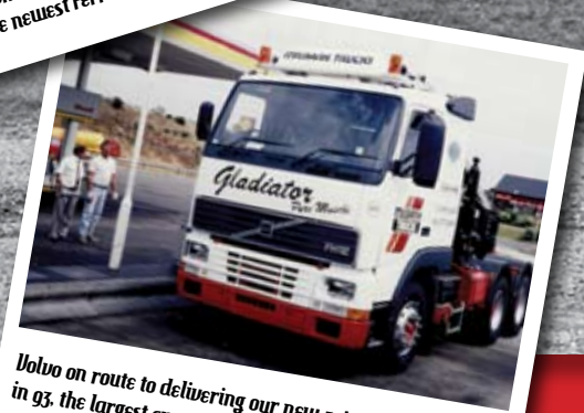
Volvo on route to delivering our new 52m Artic in 93, the largest crane of its type at the time