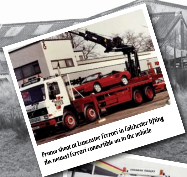
Promo shoot at Lancaster Ferrari in Colchester lifting the newest Ferrari convertible on to the vehicle