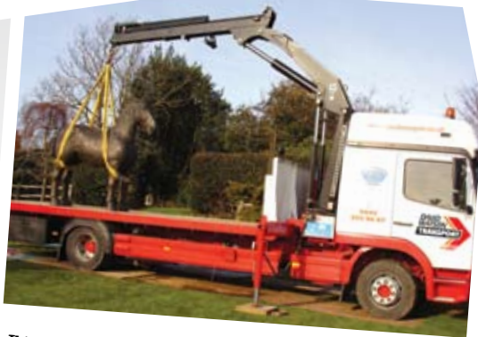
This life-size bronze horse statue worth over £500,000 was relocated from a stately home