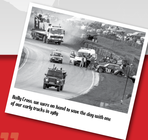
Rally Cross, we were on hand to save the day with one of our early trucks in 1989

Now no longer part of the group of companies the business has moved on, in the right hands. With nearing 100 trucks in the fleet, 120 employees and depots at all 5 locations still, David Watson Transport provide their customers with a nationwide service and expertise that allows a fast, efficient and economical response to customer needs