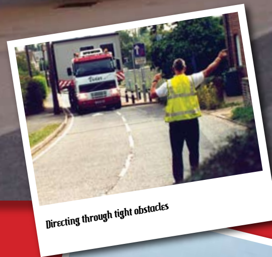
Directing through tight obstacles