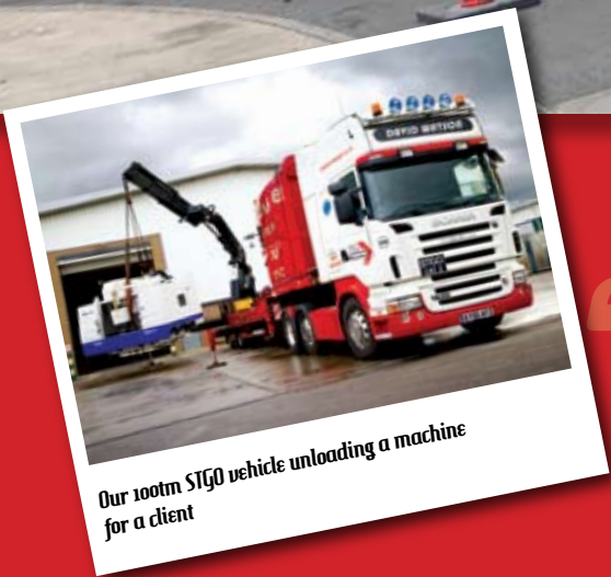
Our 100tn STGO vehicle unloading a machine for a client

“ David Watson Transport’s drivers/crane operators have the experience and knowledge required to remove, transport and install all types of machinery, safely and efficiently ”