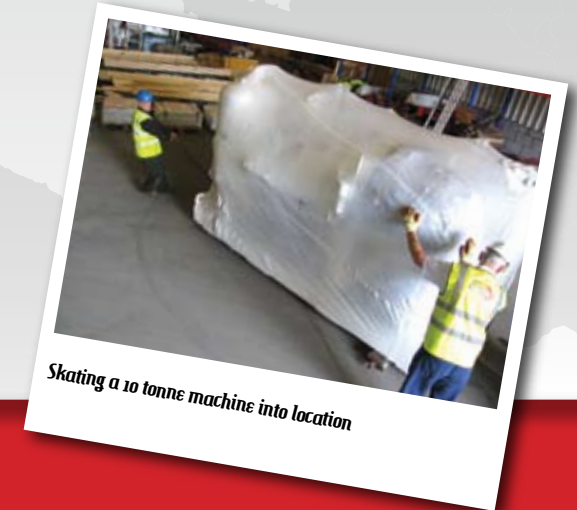
Skating a 10 tonne machine into location

“ Where required, David Watson Transport will also provide site surveys by an Appointed Person with site specific method Statements & Risk Assessments for total project management and complete peace of mind ”