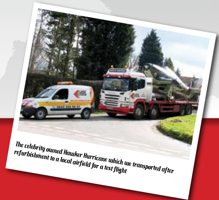
The celebrity owned Hawker Hurricane which we transported after refurbishment to a local airfield for a test flight

“ extensive range of lifting equipment and highly trained, experienced drivers, we can cover pretty much any of your lifting requirements ”